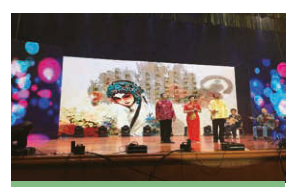
Peking opera performance in "Good Neighbor of China", the Third Neighborhood Festival 中國好鄰居第三屆鄰里節京劇表演