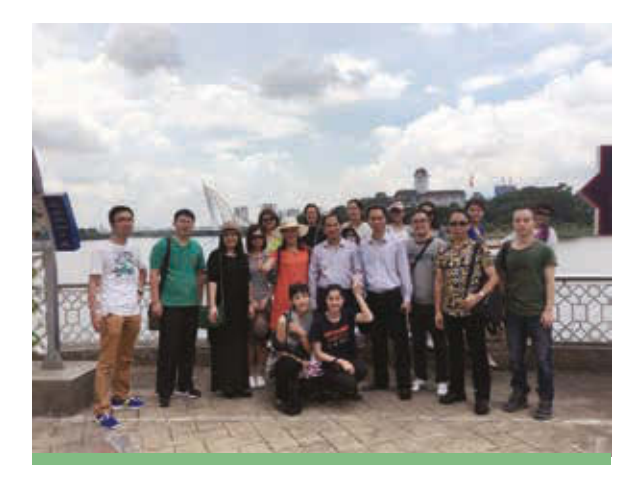
Singapore Tour 新加坡國際旅遊