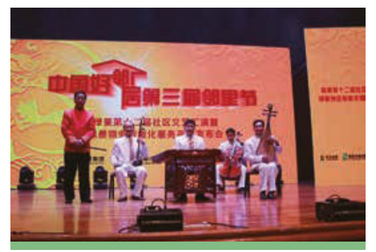
Solo performance of dizi in "Good Neighbor of China", the Third Neighborhood Festival 中國好鄰居第三屆鄰里節笛子獨奏

綠憬會是由本公司發起成立的客戶聯誼組 織,秉承[幸福綠景,一生友鄰]的宗旨,致 力於建設融洽和諧的鄰里關係,營造和諧溫 馨的鄰里關係和社區生活。過往年度,綠憬 會持續舉辦[中國好鄰居]綠憬會鄰里節,開 展了包括「綠景社區攝影大賽」、「趣味運動 會 |、「星藝廚藝大賽 |、「社區文藝匯演 |等 互動活動,藉此希望改善鄰里之間人情漠然 的現狀,弘揚鄰里守望相助的價值觀,建設 社區文化。作為全城首個啟動「鄰里節」的地 產開發商,綠景(中國)懷揣一顆精誠服務的 心,以深圳這座年輕的移民城市為主陣地, 聚焦快節奏的都市生活中「孩子沒有玩伴,老 人沒有搭檔,鄰里沒有互助」的普遍現狀, 聯合本公司開發的各大社區,引導人們尋回 失落的鄰里記憶,在歡聲笑語中分享生活智 慧,領悟幸福真諦,在城市中感受到更強 烈的歸屬感。二零一六年,本集團舉辦中國 好鄰居第三節鄰里節暨第十二屆社區文藝匯 演。本次匯演以「幸福鄰里•尋常生活」為年 度主題,通過綠景物業智能化服務平台發佈 會、社區文藝匯演、現場抽獎等形式,為來 自本集團開發的住宅社區的近千名業主及嘉賓 呈現出精彩、多元的綠景社區文化及人文關 懷。