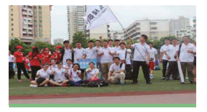
Outward bound training 戶外拓展訓練

注重瞭解員工訴求,關心員工心理,緩解員 工壓力,積極解決員工關心的問題,不斷豐 富員工的工餘文化生活,通過辦公室自動化 共用平台加強員工之間的溝通、提升員工的 滿意度、歸屬感,努力營造積極向上的和諧 融洽的組織氛圍。本集團定期舉辦員工生日 會、國內國際旅遊、各種體育競技比賽和節 日慶典。二零一六年,本集團對員工進行了 滿意度調查,調查結果顯示員工平均滿意度 為90.4分。